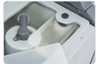
An integrated debris catch cage traps and collects drain clogging debris.