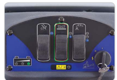
The SC750 ST / SC800 ST – provides simple operation and robust scrubbing controls.