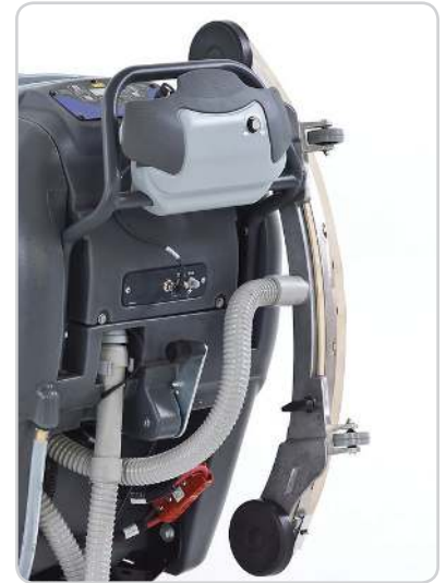
A built-in squeegee hanger makes transport easier and reduces trip and fall accidents.