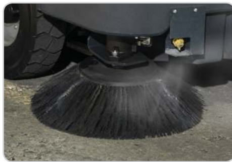
DustGuard™ suppresses airborne fugitive dust where most dust is generated – at the side brooms