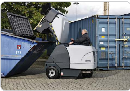
Variable dump height of up to 62 inches allows fast and simple disposal of swept debris