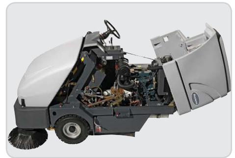
MaxAccess™ allows faster repairs and less downtime so the sweeper spends less time in the shop and more time sweeping